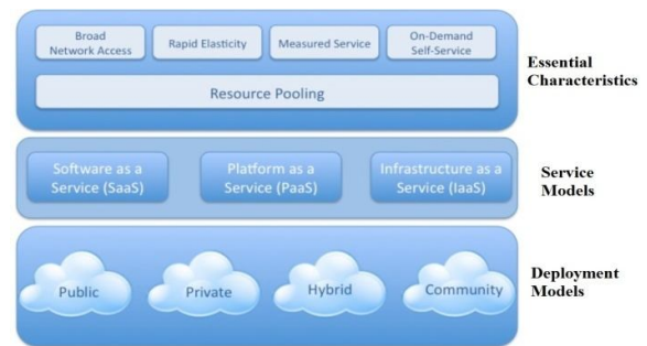
Fig. 1. Architector of cloud (Visual model)

When talking about a cloud computing system, it's helpful to divide it into two sections: the front end and the back end . They connect to each other through a network, usually the Internet. The front end is the side the computer user, or client, sees. The back end is the "cloud" section of the system.